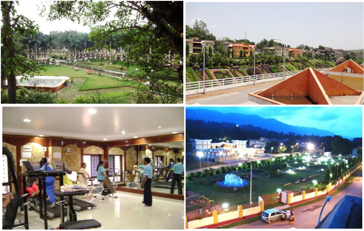
Serving Humanity is Serving Nation

Bacheli and Kirandul Townships at Bailadila Complex are located at the foothills of Bailadila hills surrounded by lush green forest and waterfalls. Bacheli is 30 km from Maa Danteshwari Temple Town / Dist. HQ Dantewada and 120 km from Jagdalpur which is commercial hub of Bastar and is well connected by road and rail to Raipur and Visakhapatnam. The nearest city Jagdalpur is connected by air to Raipur and Hyderabad. The company provides 2 BHK & 3 BHK accommodations with all amenities like 24 hrs water supply, electricity, telephone, security, pick up & drop facilities and supported by in-house maintenance. The company has high class township with all amenities like Shopping Centres, Co-operative Stores, Cafeteria, Function hall, Cultural Associations, Banks, Officers Club with well equipped gymnasium, badminton court, Swimming Pool, Parks, CBSE schools like Kendriya Vidyalaya, DAV Public School up to XII std, ICSE school Prakash Vidyalaya.